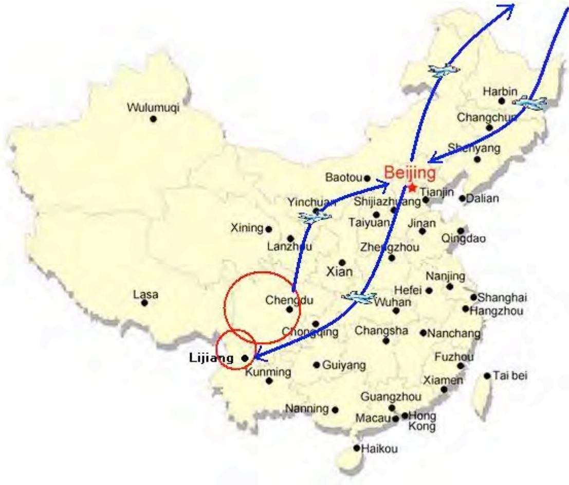
map of China